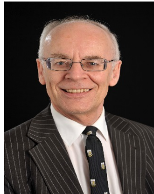
Professor The Lord Norton of Louth Workshop Organiser

The Workshop is organised by The Centre for Legislative Studies, University of Hull Director: Professor The Lord Norton of Louth